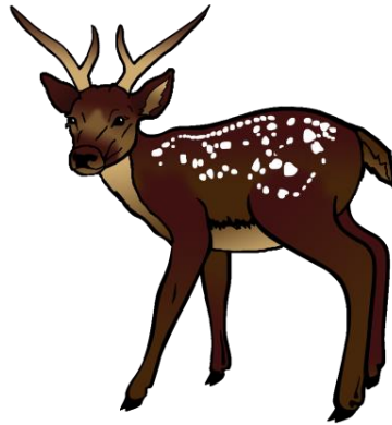
Visayan spotted deer

Helpful tips: using the scientific (Latin) name will make your search easier. On the IUCN website you will find a section on the population. This is where you will find the number of each animal.