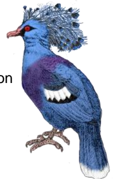
Victoria crown pigeon